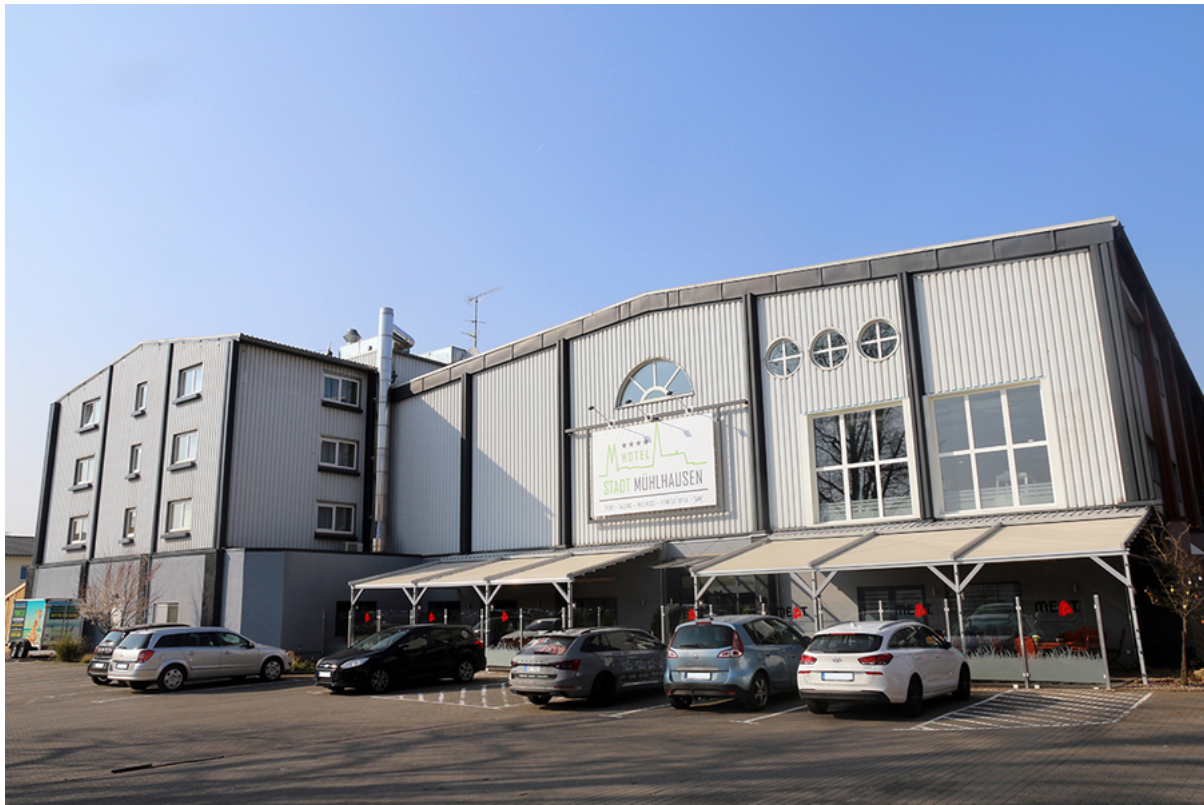
Hotel Stadt Mühlhausen