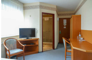
Twin bed room