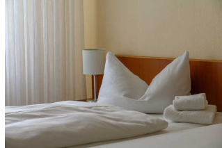
Twin bed room